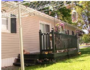
The residents of the 19 trailers will have to clear out by the end of May 2010. (CBC)

Residents of a trailer park in Charlottetown have been served eviction notices as the owner tries to clear the way to building condominiums on the site.